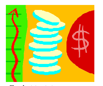
Fundraising is important to run a troop the size of Troop 19.

Let's all get together and make this a great sale/ carwash/bake sale. The funds we gather will go toward troop operating expenses and equipment.