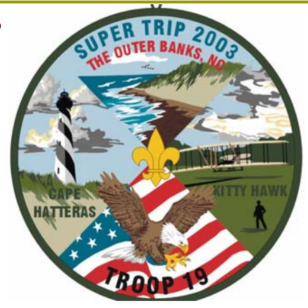
With the assistance of ASM

From July 8 to July 14, Troop 19 will be visiting the Outer Banks of North Carolina to be part of the 100th Anniversary celebration of the Wright Brothers' First Flight at Kitty Hawk and Kill Devil Hills, NC.